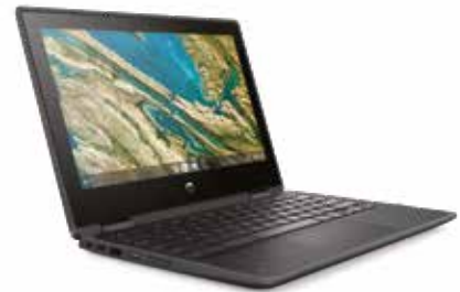
HP Chromebook x360 11 G3 Education Edition